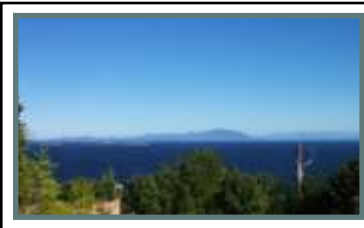
EAGLE POINT VIEW